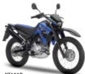
XT125R Racing Blue (MAB)