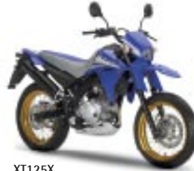
XT125X Racing Blue (MAB)