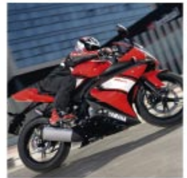
YZF-R125 fitted with genuine Yamaha accessories.