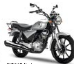
YBR125 Custom Light Grey Metallic (LGM3)