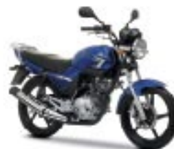
YBR125 Yamaha Blue (DPBMC)