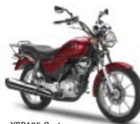
YBR125 Custom Red Spirit (VRC7)