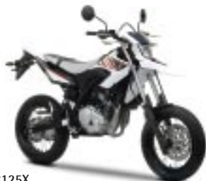
WR125X Sports White (PSW1)