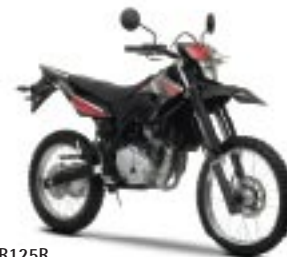
WR125R Yamaha Black (YB)