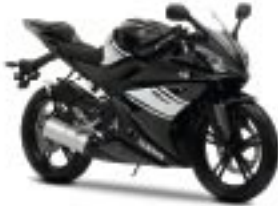
YZF-R125 Midnight Black (SMX)