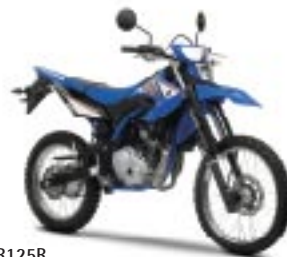
WR125R Racing Blue (DPBSE)