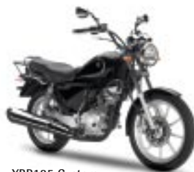
YBR125 Custom Midnight Black (SMX)