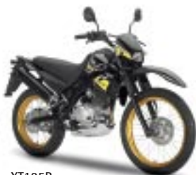
XT125R Yamaha Black (MASB)