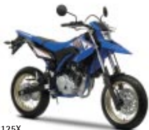
WR125X Racing Blue (DPBSE)