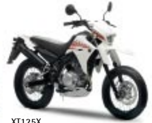
XT125X White Flash (MAW)