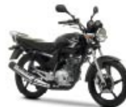
YBR125 Midnight Black (SMX)