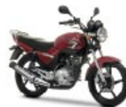
YBR125 Red Spirit (VRC7)