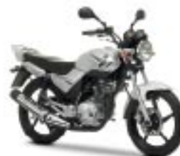
YBR125 Light Grey Metallic (LGM3)