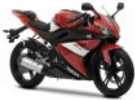
YZF-R125 Sunset Red (VYR1)