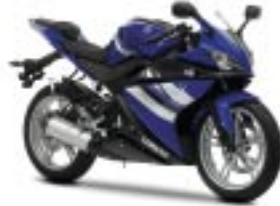
YZF-R125 Burning Blue (VPBC3)