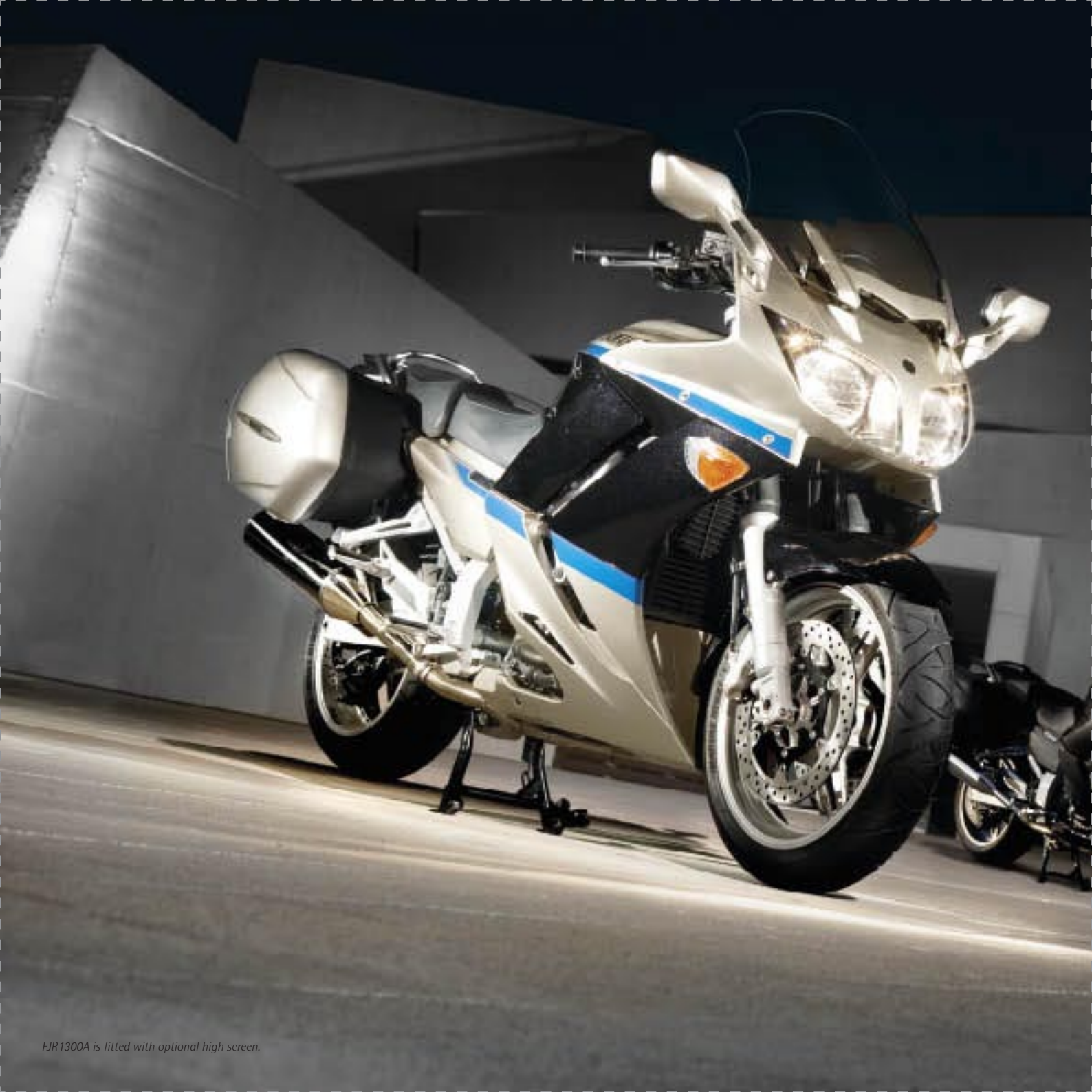
FJR1300A is fitted with optional high screen.