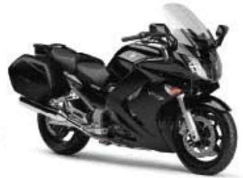
FJR1300A/AS – Midnight Black (SMX)