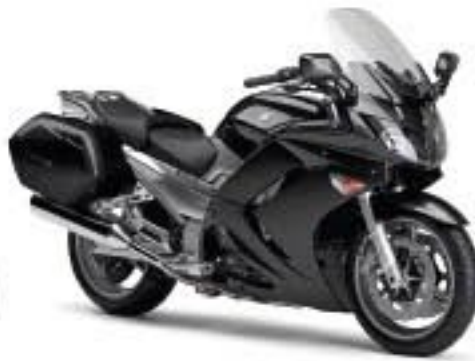
FJR1300A/AS – Smokey Grey (DNMA)