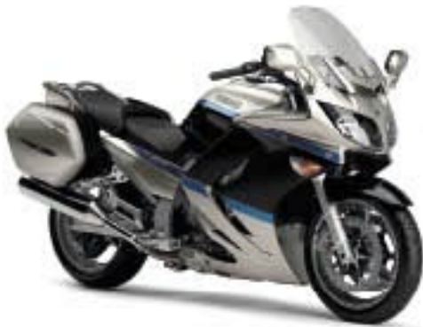
FJR1300A/AS – Sunset Silver (LYNM9)