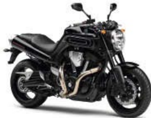
MT-01 – Midnight Black (SMX)