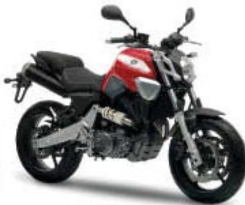
MT-03 – Racing Red (VRC1)