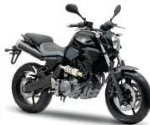
MT-03 – Midnight Black (SMX)