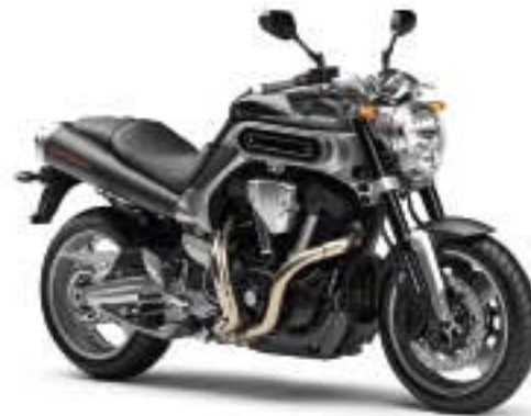
MT-01 – Graphite (DNMG)